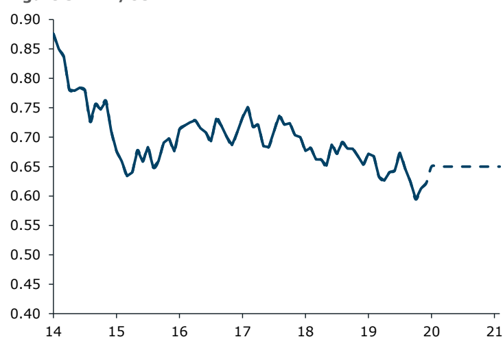
Figure 3. NZD/USD

Global equity markets have been incredibly resilient in the current economic environment. It now appears that the scale of the economic shock to date has not been sufficient to drive risk assets and general risk appetite lower, and this has been supportive of the NZD.